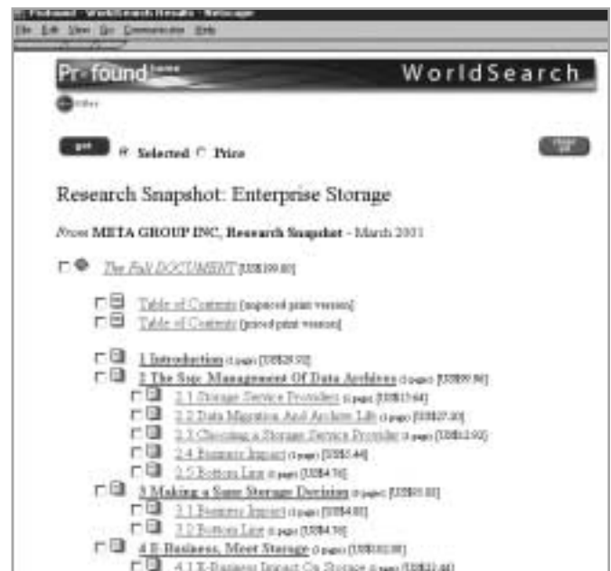
Portion of Table of Contents from a typical META Snapshot report

For more information on all of these publishers, please visit the Profound Sourcebook at: http://library.dialog.com/sourcebook . ♦