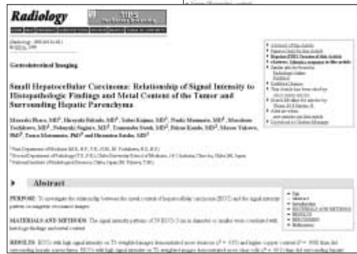
Step 3 View the fulltext of the article.

For more information, see the online story.