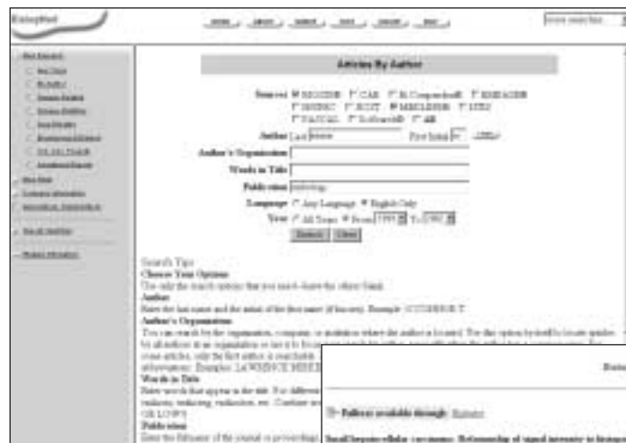
Step 1 Perform a search in DialogMed.